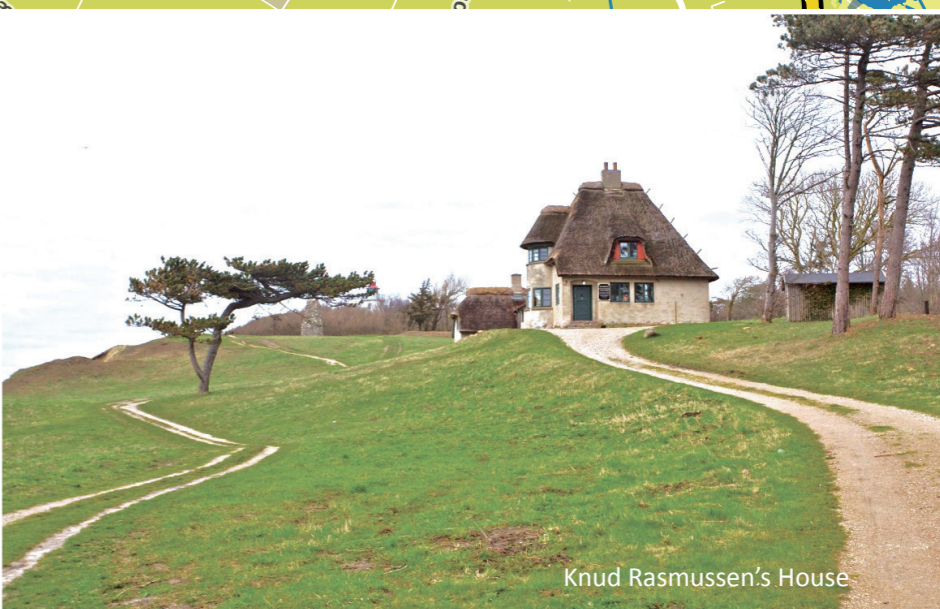
Knud Rasmussen's House